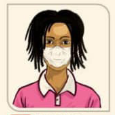
DON'T: Leave hair down face