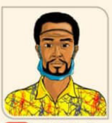
DON'T: Pull below chin