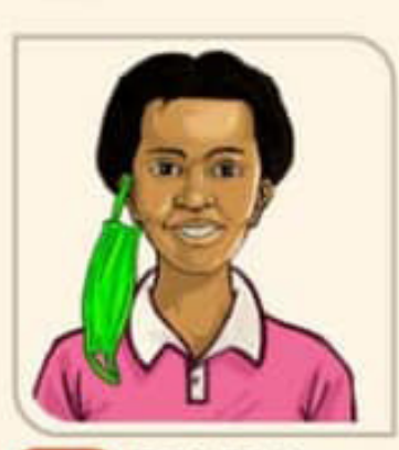
DON'T: Hang from one ear