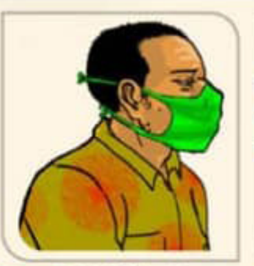
DO: Tie straps behind head & neck