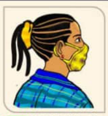
DO: Pull hair back