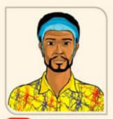
DON'T: Wear on forehead