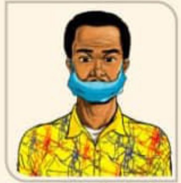
DON'T: Pull below the nose