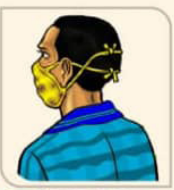
DON'T: Cross straps