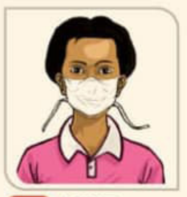
DON'T: Leave a strap hanging