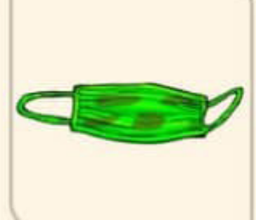
DON'T: Wear a dirty or wet mask