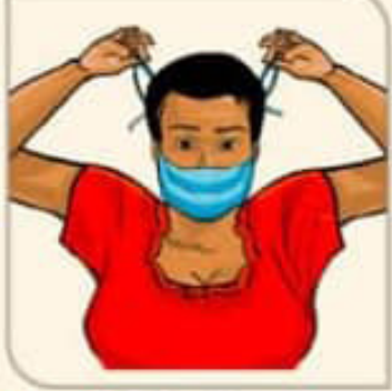
DO: Remove by grabbing from the back